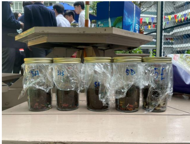
STUDENT LED WORKSHOP